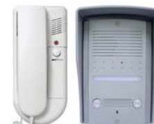
Intercom Internal and external Kit