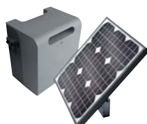
Solemyo Solar Kit