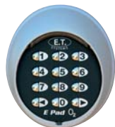
E-Pad 02 Wireless Access Control Keypad