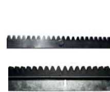
Steel or Nylon Rack